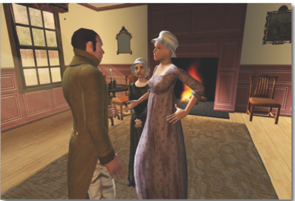
Eduweb 2014, all rights reserved

Players will have to investigate existing cases to learn more about the spread of disease. Having chosen a neighborhood from the map view, they must then visit the neighborhood in order to interact with inhabitants.