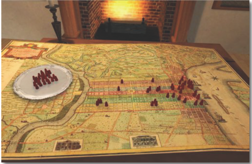
Eduweb 2014, all rights reserved

the large number of boarding houses located on the street? And how about the cases over by the Schuylkill?