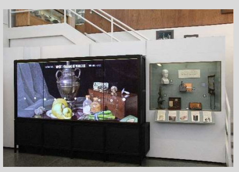
Exhibit display from How Medicine Became Modern at the Dittrick Museum of Medical History, Case Western Reserve University. artsci.case.edu/Dittrick

CHIPPEWA VALLEY MUSEUM, Eau Claire, WI Farm Life: A Century of Change for Farm Families and Their Neighbors Long-term. www.cvmuseum.com