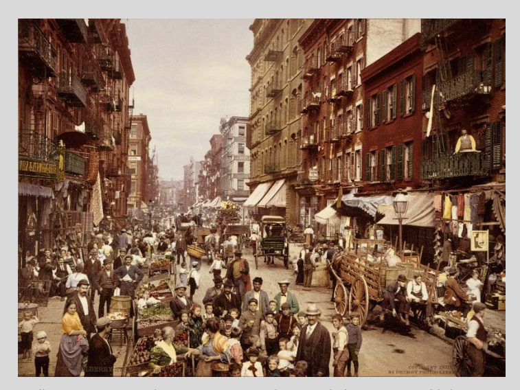
Mulberry Street, Manhattan, ca. 1900. Photograph by Detroit Publishing Co., Library of Congress Prints and Photographs Division. From the exhibition New York at Its Core at the Museum of the City of New York. Courtesy, Museum of the City of New York. mcny.org

October 3 to October 26 UNIVERSITY OF MINNESOTA, Duluth, MN First Folio! The Book That Gave Us Shakespeare Traveling.