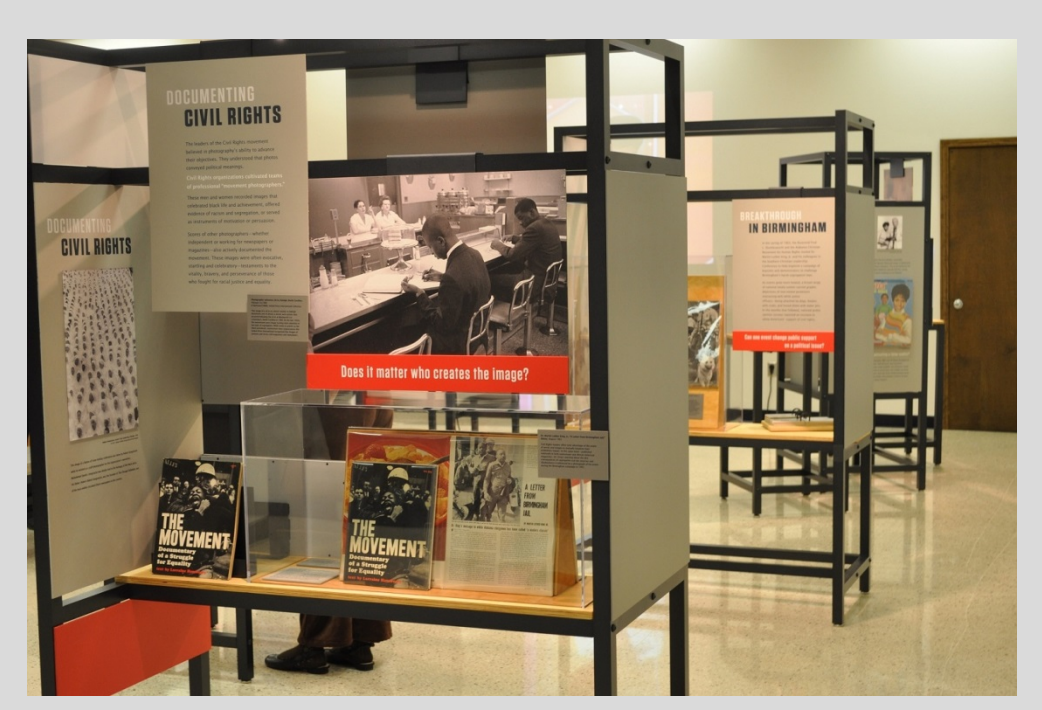
Installation view of the NEH on the Road traveling exhibition, For All the World to See . Wyandotte County Museum, Bonner Springs, Kansas. April 2012. The exhibition is currently at the Bessie Smith Cultural Center, Chattanooga, Tennessee. Courtesy, Mid-America Arts Alliance. www.nehontheroad.org

Long-term. Organized by the Bevill State Community College. www.bscc.edu/elliot