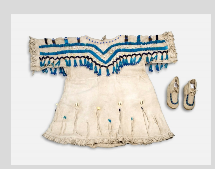
Beaded child's dress and moccasins, Cheyenne, natural hide and glass trade beads, c. 1890, 4 1/2 x 11 x 12, collection C.M. Russell Museum, Great Falls, Montana. From the NEH on the Road traveling exhibition Bison . The exhibition is currently at the Bell County Museum, Belton, Texas. www.nehontheroad.org