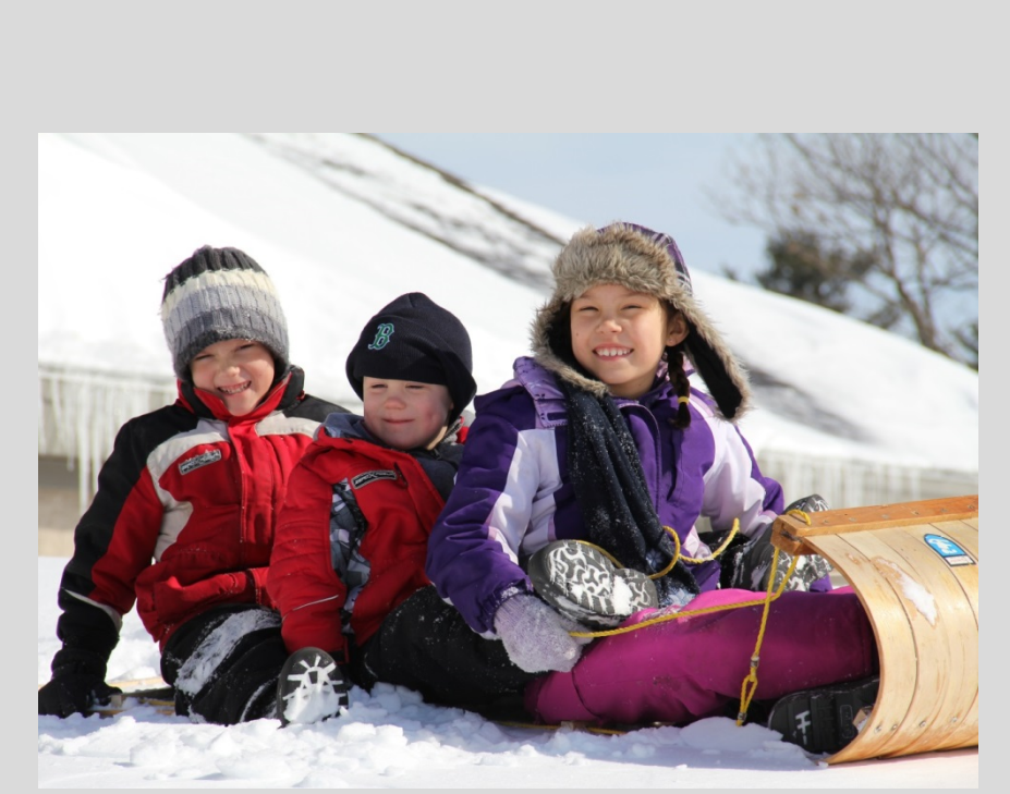
Children on a toboggan from the exhibition Native Voices: New England Tribal Families at the Bay Area Discovery Museum, San Francisco, California.

ASIAN ART MUSEUM OF SAN FRANCISCO, San Francisco, CA Permanent Collections Galleries Long-term. www.asianart.org