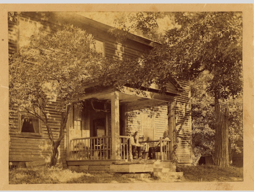
The Robinson family home as it appeared when fugitive slaves found shelter here in the 1830s and 1840s from the exhibition The Underground Railroad in Vermont at the Rokeby Museum, Ferrisburgh, Vermont. www.rokeby.org

MUSEUM OF WORK AND CULTURE, Woonsocket, RI La Survivance: French-Canadians in Woonsocket, Rhode Island Long-term. Organized by the Rhode Island Historical Society. www.rihs.org