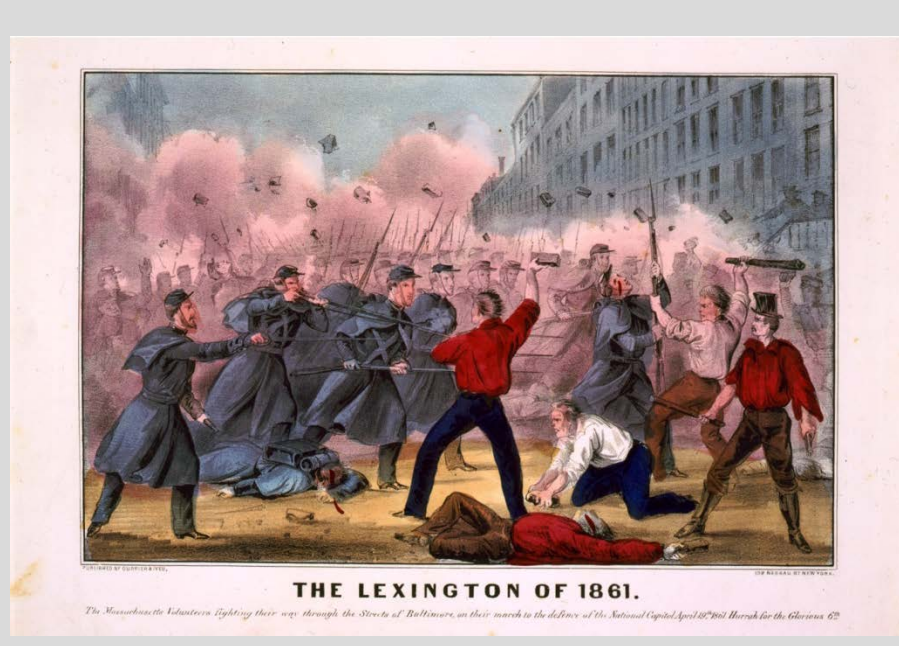
A mob's attack on Union troops in Baltimore in the earliest days of the war prompted Lincoln to suspend the writ of habeas corpus and declare martial law. Currier and Ives lithograph, 1861, from the traveling exhibition Lincoln: The Constitution and the Civil War . Courtesy, Library of Congress, Prints & Photographs Division. www.ala.org