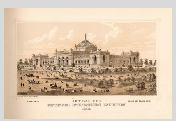
Image from the exhibition Centennial Exploration at the Please Touch Museum®, Philadelphia, Pennsylvania.

LOWER EAST SIDE TENEMENT MUSEUM, New York, NY Shop Life