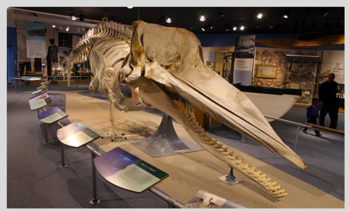
Whale skeleton from the exhibition From Pursuit to Preservation: The Global Story of Whales and Whaling at the New Bedford Whaling Museum, New Bedford, Massachusetts. Courtesy, New Bedford Whaling Museum. www.whalingmuseum.org/explore/exhibitions/current/pursuit-to-preservation

NEW BEDFORD WHALING MUSEUM, New Bedford, MA