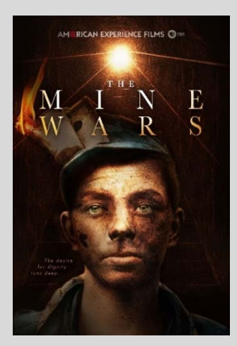
Image from the documentary The Mine Wars airing on PBS's American Experience January 26, 2016 ( check local listings ). www.pbs.org/wgbh/americanexperience/films/the minewars

Long-term. Organized by the National Trust for Historic Preservation. www.whitehousehistory.org/decaturhouse/african-american-tour/Default.aspx