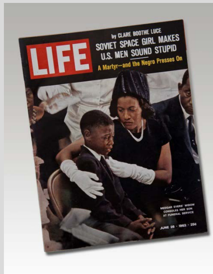
Medgar Evers Funeral, Life magazine, June 28, 1963. From the NEH on the Road traveling exhibition For All the World to See: Visual Culture and the Struggle for Civil Rights , 2011.

Traveling. Based on an exhibition organized by the Museum of International Folk Art.