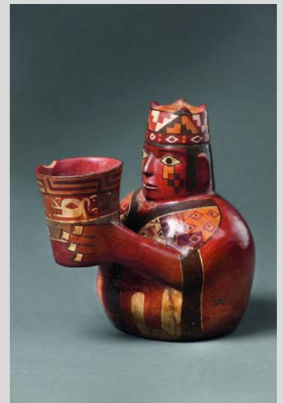
From left to right: Figure in Tapestry-Woven Tunic and Four-Cornered Hat, 600–1000. Peru, Wari. Ceramic and slip; 28.7 x 23 cm. Fundación Museo Amano, Lima FMAC-000020. Head Vessel, 600–1000. Peru, Wari. Ceramic and slip; 18 x 12 cm. Museo Nacional de Arqueología, Antropología e Historia del Perú, Lima C-54786. Cup-Holding Figure in Tie-Dyed Tunic and Four-Cornered Hat, 600–1000. Peru, Wari. Ceramic and slip; 19.3 x 19.5 cm. Museo Regional de Ica “Adolfo Bermúdez Jenkins” MRI-00176-01. From the exhibition Wari: Lords of the Ancient Andes at the Kimbell Museum, Fort Worth, Texas. www.clevelandart.org