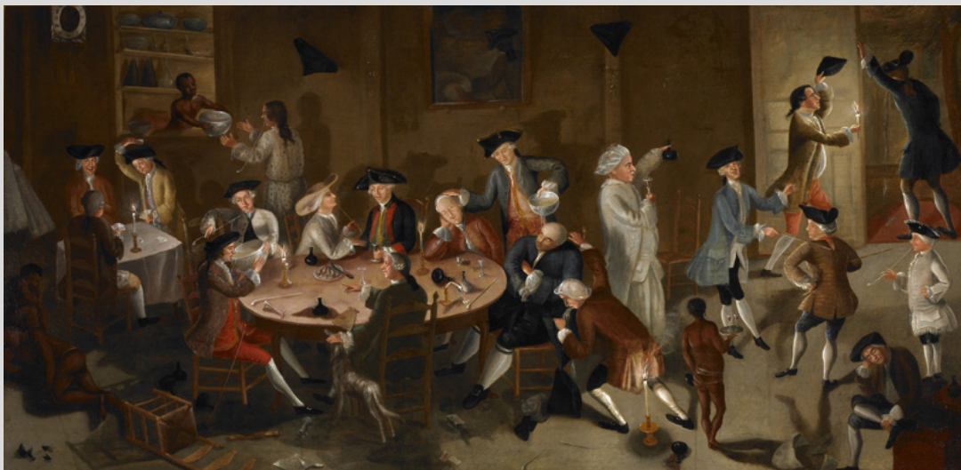
John Greenwood (1727-1792), Sea Captains Carousing in Surinam, ca. 1752–1758. Oil on bed ticking. Saint Louis Art Museum, Museum Purchase 256:1948, from the exhibition Revolution!: The Atlantic World Reborn at the John Carter Brown Library, Brown University, Providence, Rhode Island.

BROWN UNIVERSITY, JOHN CARTER BROWN LIBRARY, Providence, RI Revolution: The Atlantic World Closes April 28. Traveling. Organized by the New-York Historical Society. www.nyhistory.org