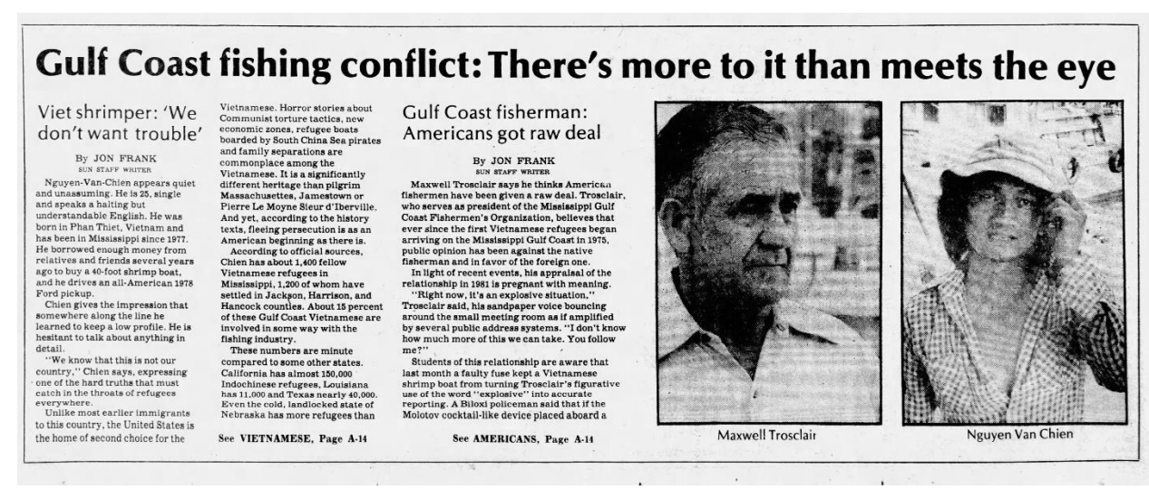
Clipping from The Daily Herald on May 3, 1981.

Local History and Genealogy Department only limited photographs. This community lost significant cultural items from Hurricane Katrina's 20-foot storm surge. <sup>9</sup> This makes the task of preservation more challenging in the Biloxi Vietnamese community.