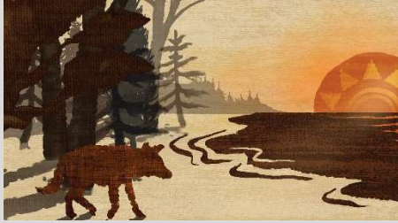
Origins animation from the exhibition Idaho: The Land and Its People at the Idaho State Museum, Boise, Idaho.

DESERT BOTANICAL GARDEN, Phoenix, AZ Plants and People of the Sonoran Desert Long-term. www.dbg.org