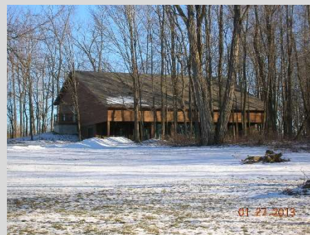
The Education Center, part of the exhibition Underground Railroad in Vermont at Rokeby Museum, Ferrisburgh, Vermont. www.rokeby.org

SENATOR JOHN HEINZ PITTSBURGH REGIONAL HISTORY CENTER, Pittsburgh, PA Pittsburgh: A Tradition of Innovation Long-term. www.pghhistory.org