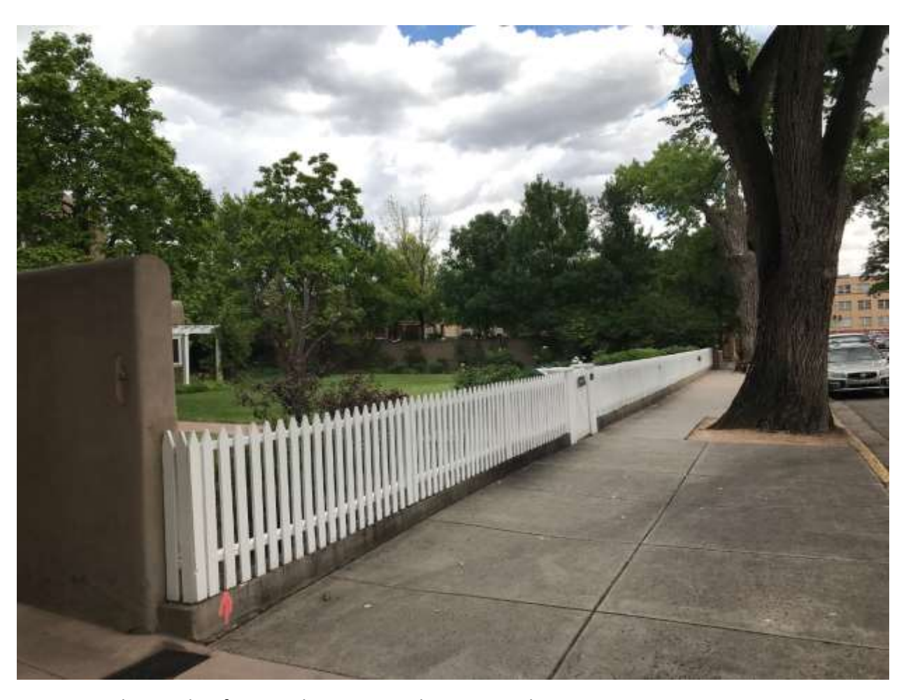
Figure 3: White picket fence. July 2, 2021, John W. Murphey.