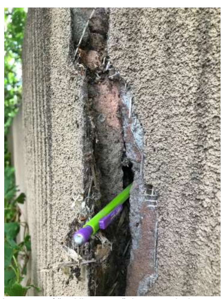
Figure 24: Delamination of "Middle Section," showing multiple stucco applications. July 2, 2021, John W. Murphey.