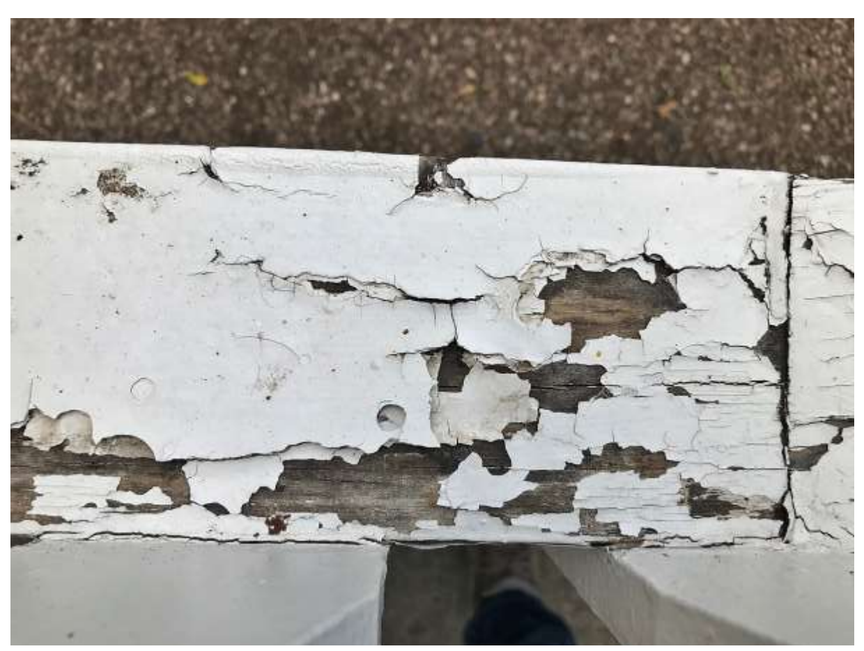
Figure 8: Top rail with multiple layers of paint. July 2, 2021, John W. Murphey.