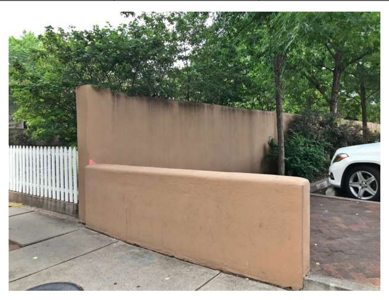
Figure 23: "West Section" terminus. July 2, 2023, John W. Murphey.