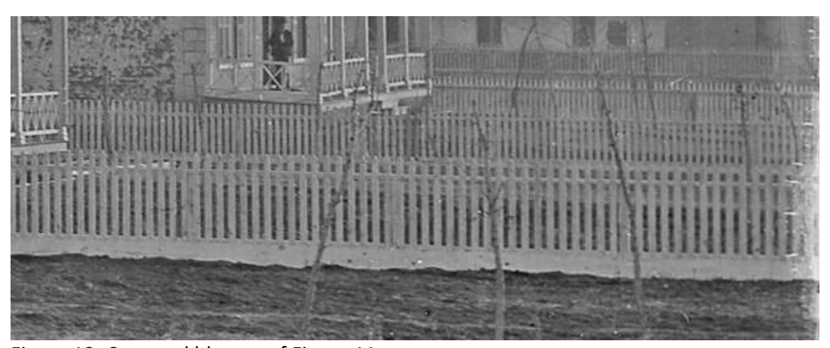
Figure 12: Crop and blowup of Figure 11.