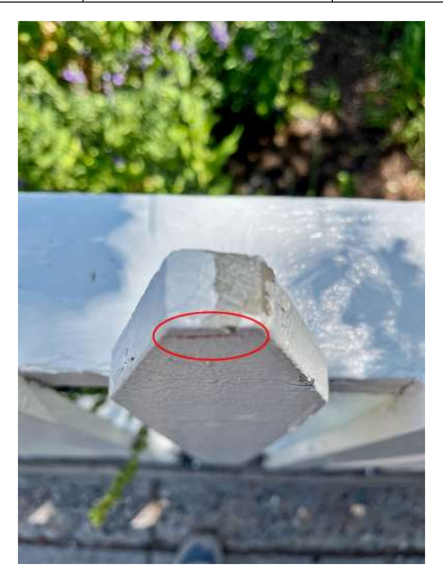
Figure 4: Picket head. Apparent cut line circled. July 25, 2023, John W. Murphey.