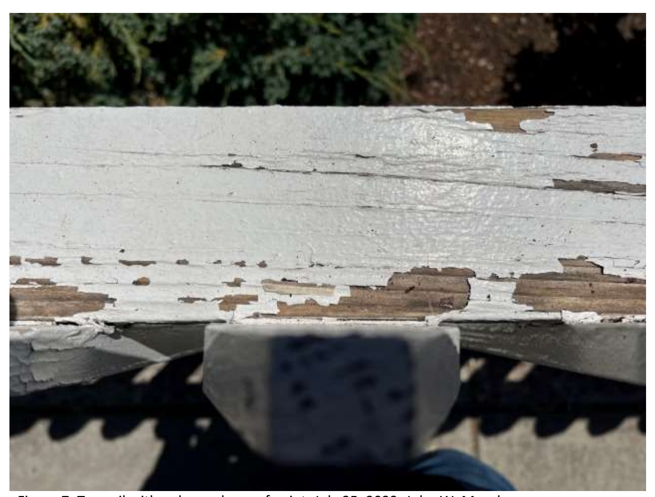
Figure 7: Top rail with only one layer of paint. July 25, 2023, John W. Murphey.