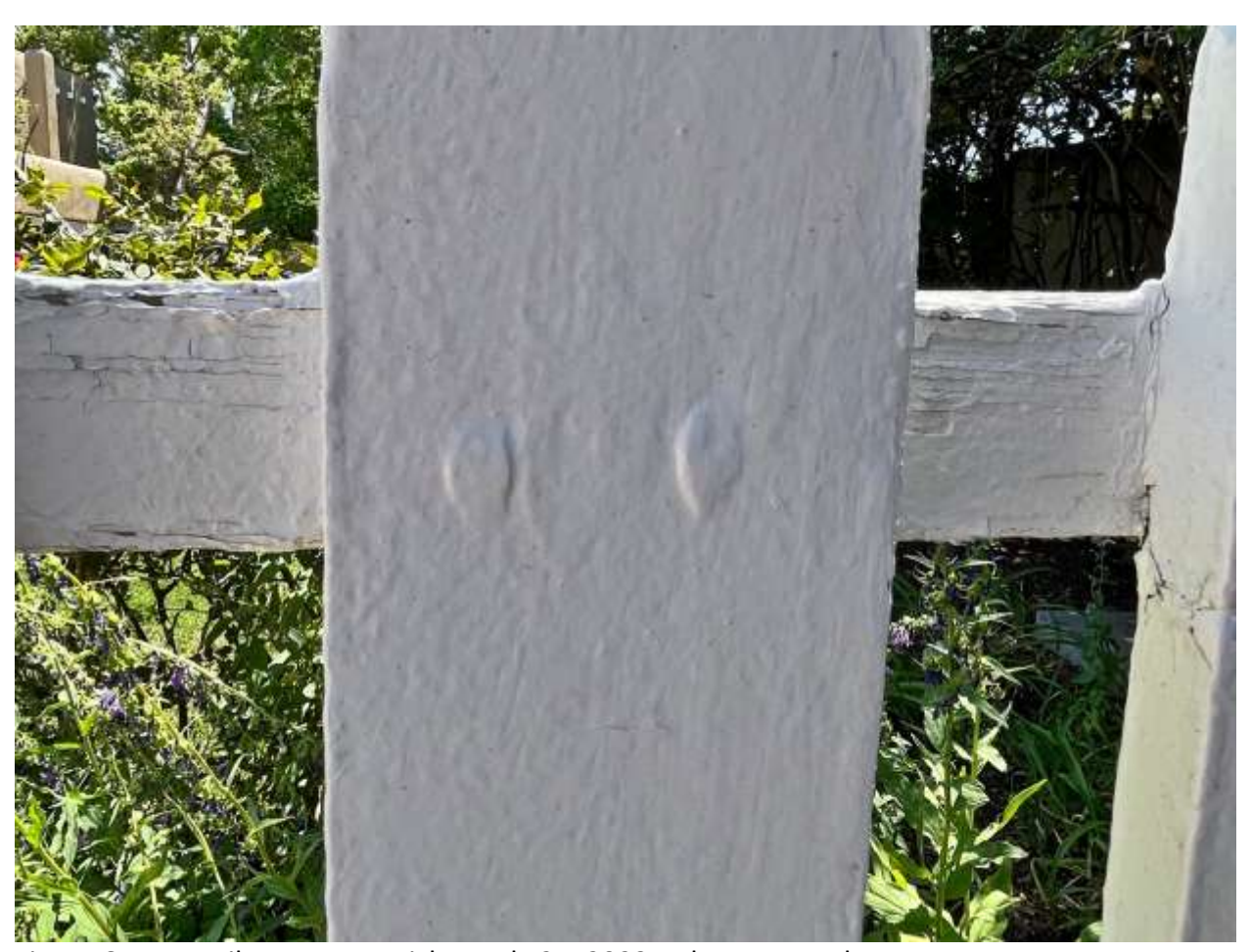
Figure 6: Two-nail pattern on picket. July 25, 2023, John W. Murphey. Note multiple layers of paint on top rail.