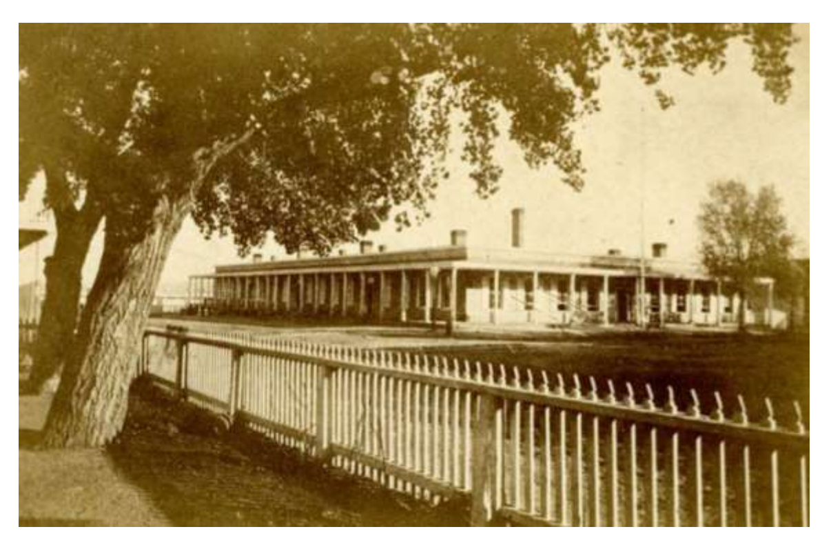
Figure 14: Headquarters Building, c.1880-82. William Henry Jackson, photographer. Source: Negative # 001723, Palace of the Governors Photo Archives, New Mexico History Museum, Santa Fe, New Mexico.