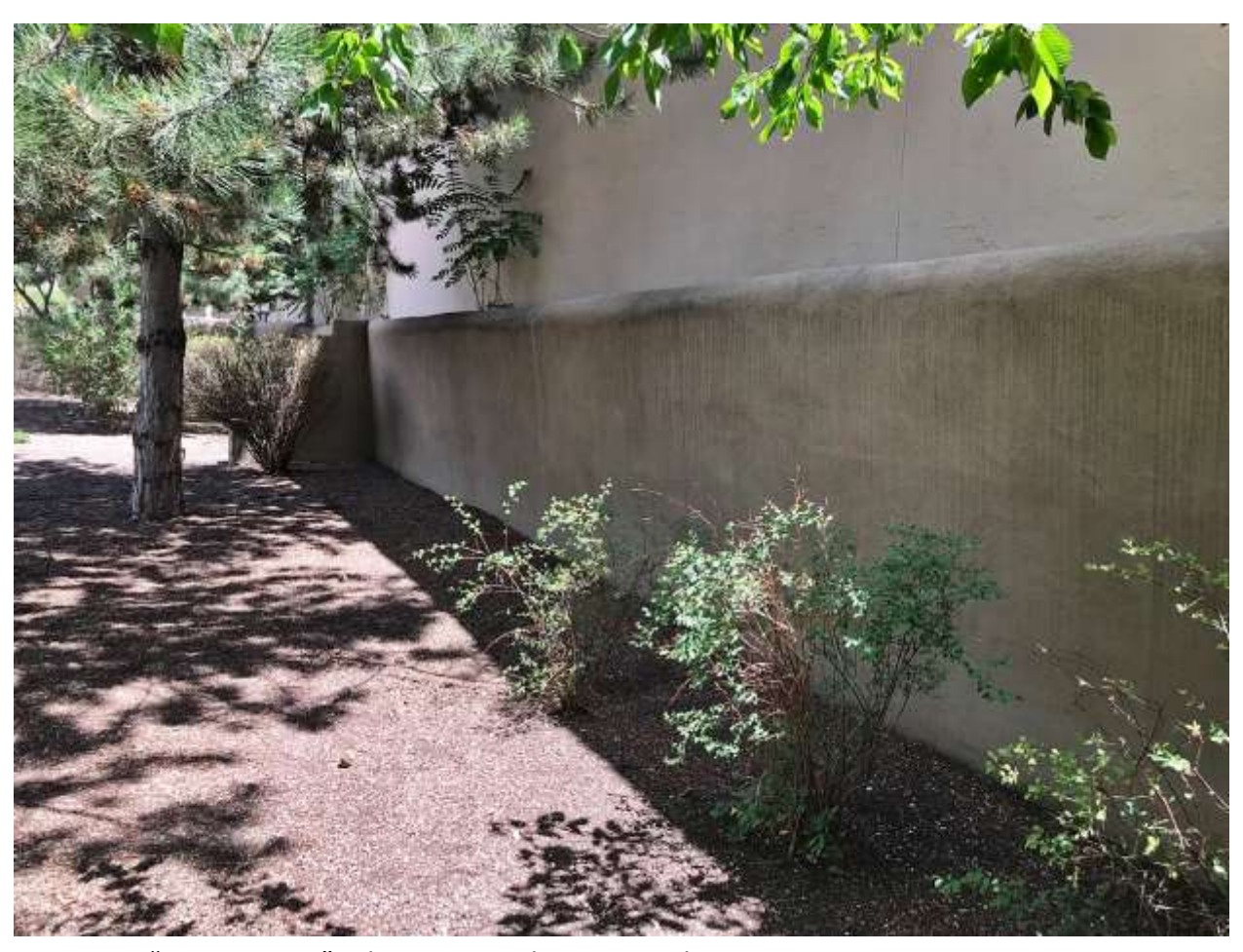
Figure 19: "East Section." July 2, 2023, John W. Murphey.