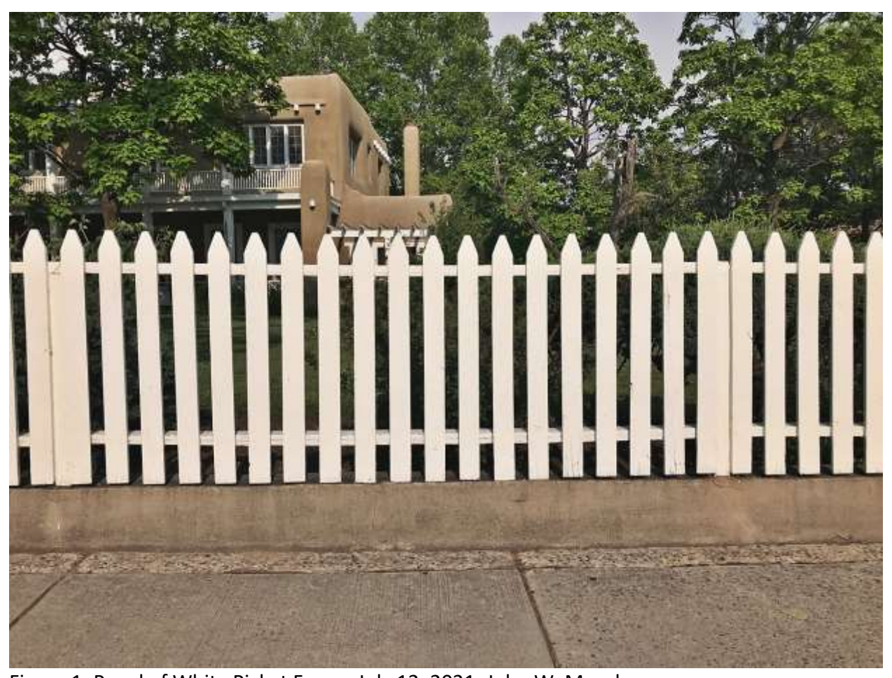
Figure 1: Panel of White Picket Fence.

John W. Murphey Architectural History Services, August 10, 2023