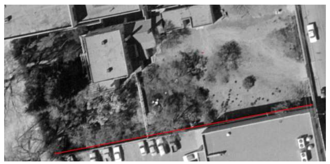
Figure 27: May 1, 1973, aerial photograph. A wall is visible.