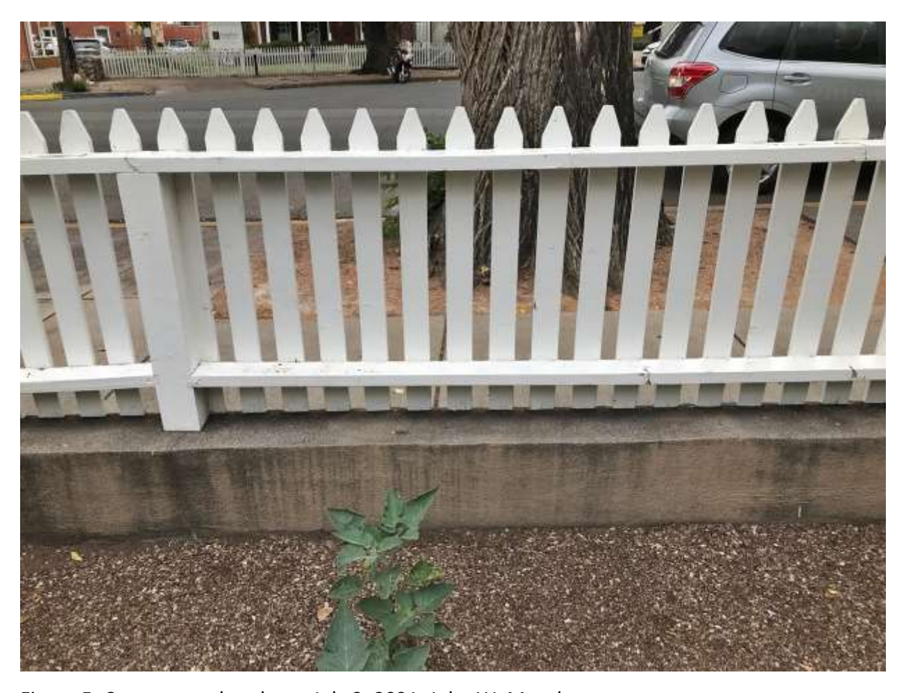
Figure 5: Concrete curb or base. July 2, 2021, John W. Murphey.