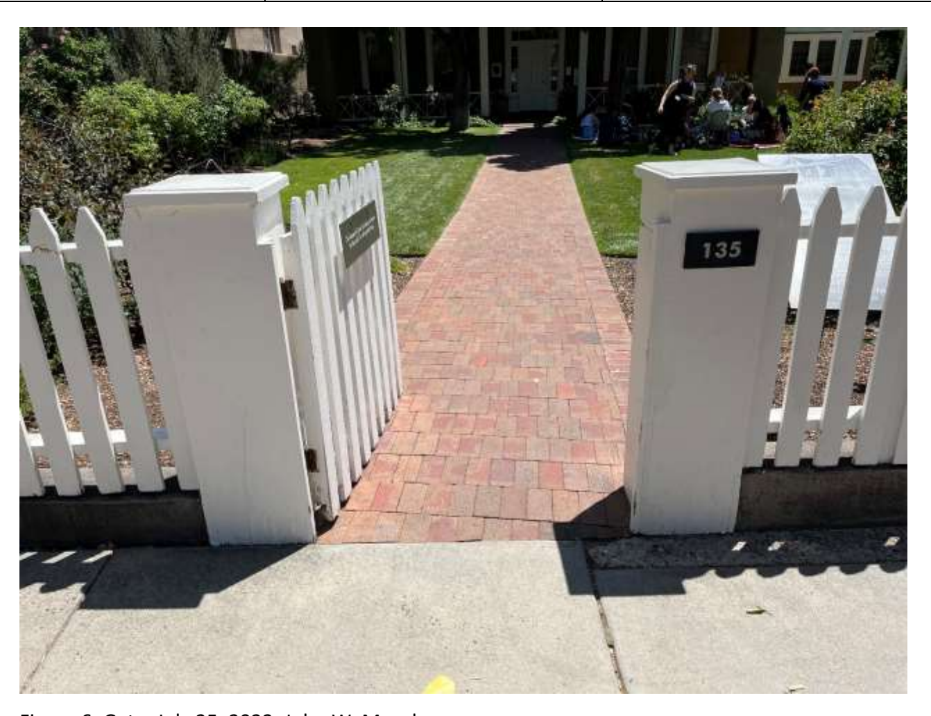
Figure 6: Gate. July 25, 2023, John W. Murphey.