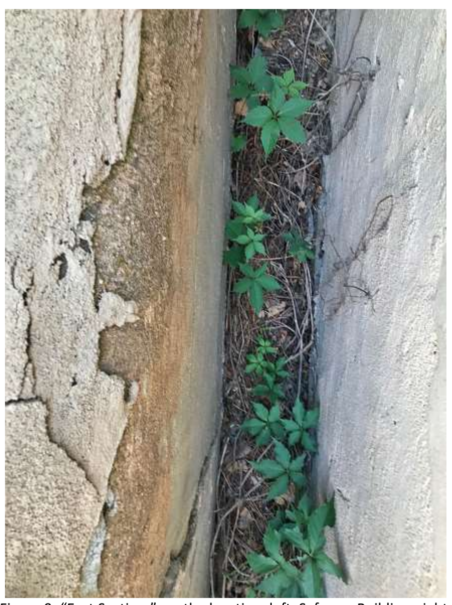
Figure 9: "East Section," south elevation, left, Safeway Building, right. July 2, 2023, John W. Murphey.