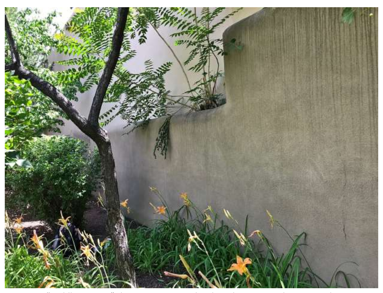
Figure 21: "Middle Section," showing increase in height. July 2, 2021, John W. Murphey.