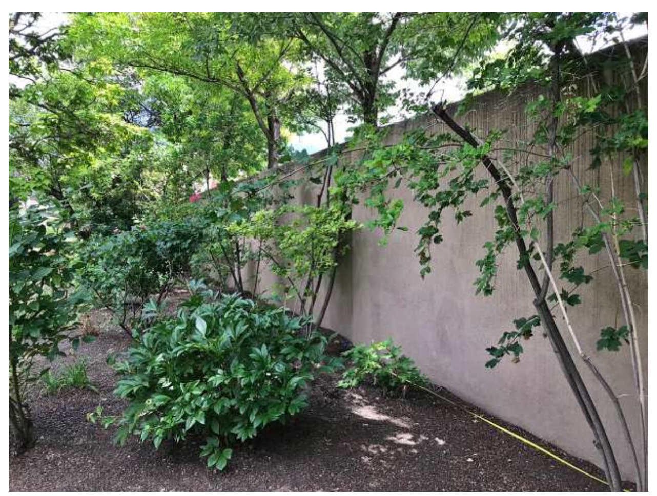
Figure 102: "West Section." July 2, 2021