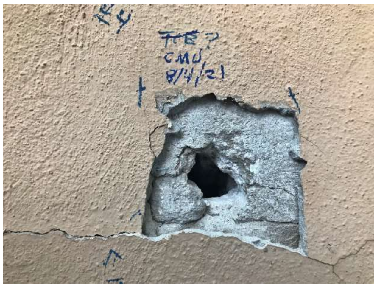
Figure 25: Test bore #4, "Middle Section," showing CMU construction. August 4, 2021, John W. Murphey.