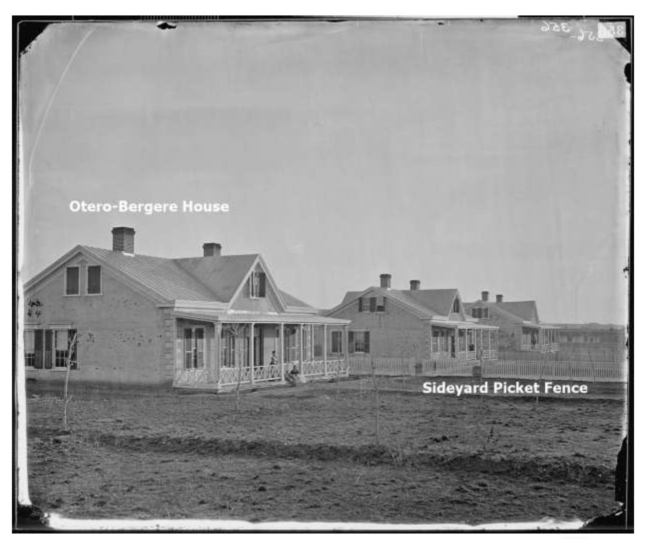
Figure 11: Otero-Bergere House, 1873.