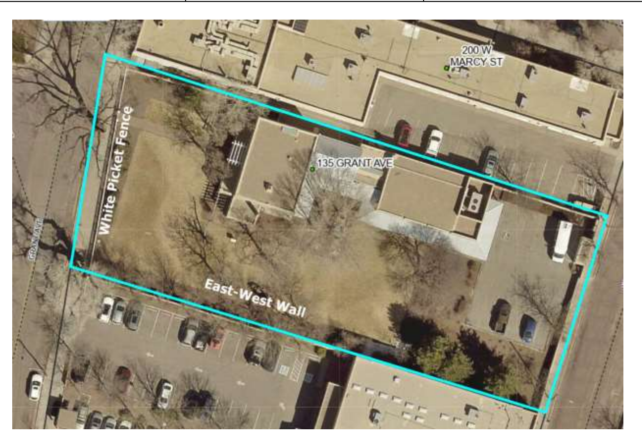
Figure 2: Parcel aerial.