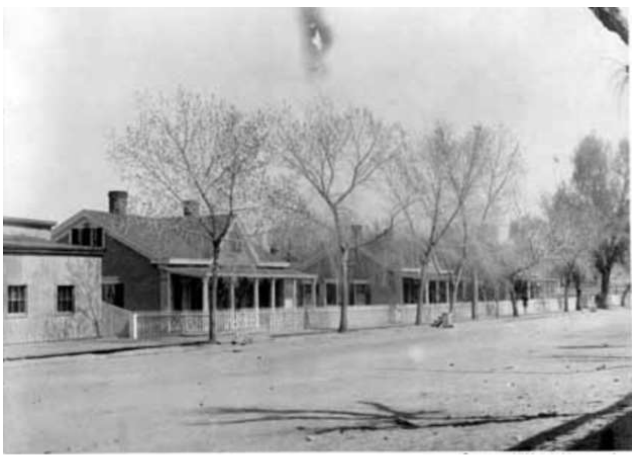
Figure 13: Officers' Quarters, Lincoln Avenue, c.1880-82.