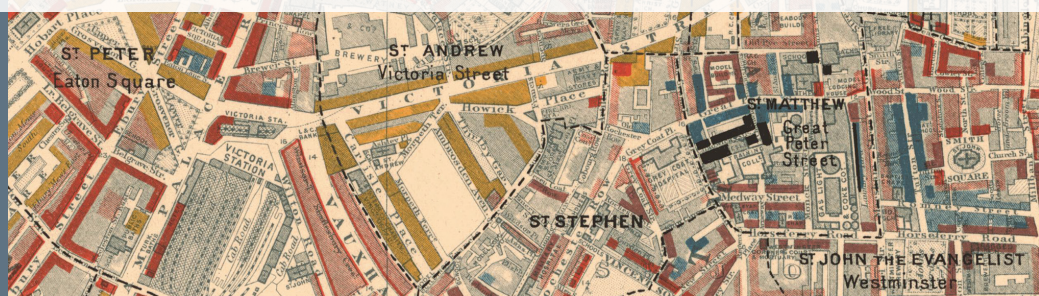
Photo credits, from top to bottom: Museum visitors, Julian Mora, Unsplash; Alexander Calder's Flamingo sculpture in downtown Chicago, Anthony Lynn/Alamy Stock Photo; poster from the French war in Indochina, Agostini/UIG/ Everett Collection; José Martí, Album/Art Resource, NY; from Charles Booth's 1889 map of poverty in London, © 2016 London School of Economics & Political Science.

FOR APPLICATION INFORMATION: www.neh.gov/divisions/education/summer-programs