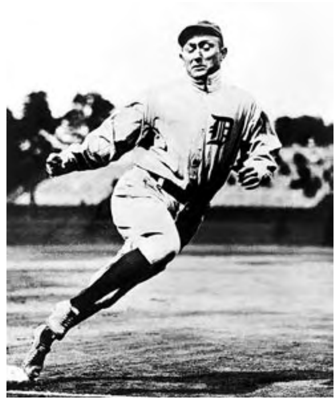
Native Georgian Ty Cobb is featured in the New Georgia Encyclopedia Online.

the 1600s to the late twentieth century.