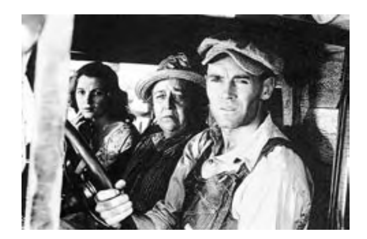
The California Humanities Council leads a statewide reading program on John Steinbeck's The Grapes of Wrath .

The councils are directly responsible for the revival of Chautauqua, the nineteenth-century institution that combines public entertainment and learning, and what Theodore Roosevelt once called "the most