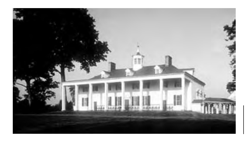
Mount Vernon circa 1855.

Mount Vernon Ladies' Association of the Union