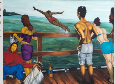
Coney Island Pier , 1995, oil on canvas, by Daze. Collection of the artist. From the exhibition Coney Island: Visions of an American Dreamland, 1861–2008 at the San Diego Museum of Art.