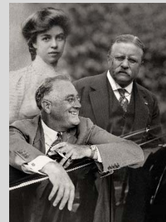
Promotional image from the documentary "The Roosevelts" airing on PBS September 14 (check local listings). www.pbs.org/kenburns/films/the-roosevelts