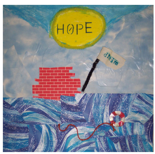
Figure 9 : Collage by 5<sup>th</sup> grader, Jake Wollfarth of New Orleans, following the Hurricane Katrina disaster

Many thanks to the collaborative efforts of disaster responders who strive to preserve our cultural heritage, some of which include Heritage Preservation (and especially Jane