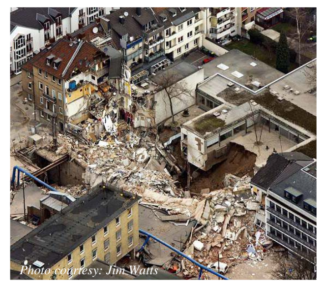
Figure 2 : Archives collapse in Cologne, Germany, in March 2009

In the past 2 years, the world has witnessed swift and staggering losses to our global heritage caused by natural and man-made disasters. Recent examples of these national disasters include the 2007 fire at the Georgetown Library of Washington, D.C., the 2008 Plympton Library fire in Plympton, Massachusetts, and catastrophic flooding of the National Czech and Slovak Museum and Library in Cedar Rapids, Iowa [Fig. 1]. Moreover, the threat to our global cultural heritage extends internationally: the 2007 earthquake at the Gisborne Library in Gisborne, New Zealand, and the 2009 archives collapse in Cologne, Germany [Fig. 2], are only two to mention.