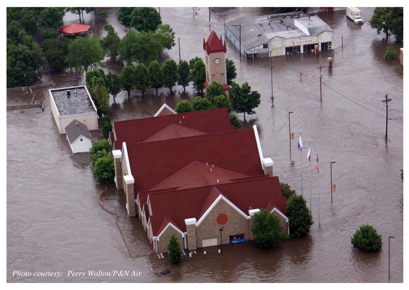
Figure 1: The National Czech and Slovak Museum and Library, Cedar Rapids, Iowa, in Summer 2008