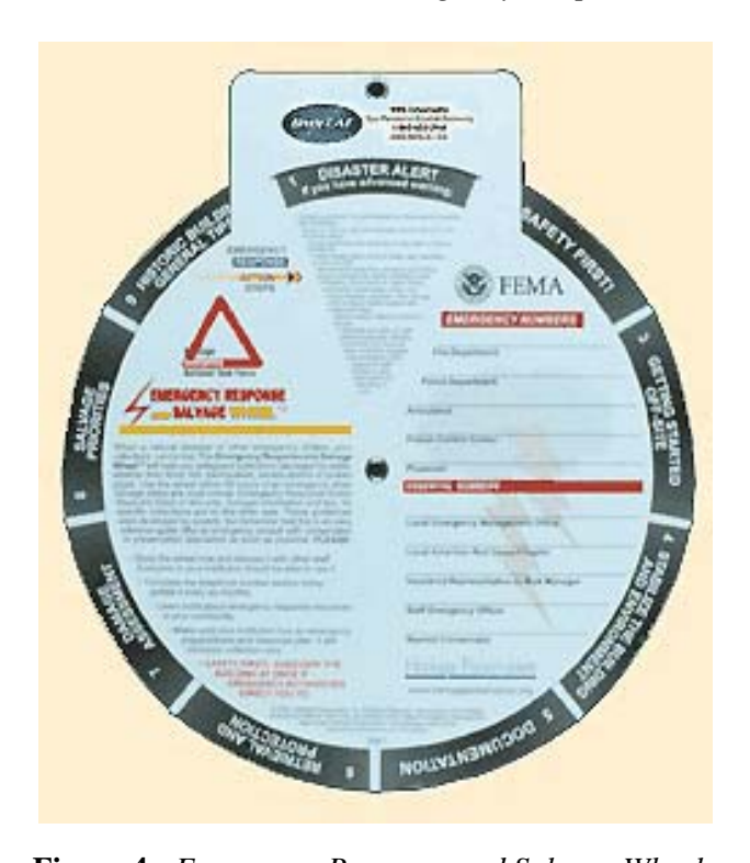
Figure 4: Emergency Response and Salvage Wheel

Perhaps one of the best outcomes that emerged from the Task Force's work is the creation of practical educational tools, including the Emergency Response and Savage Wheel [Fig.4] and the Field Guide to Emergency Response .